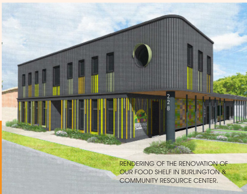
RENDERING OF THE RENOVATION OF OUR FOOD SHELF IN BURLINGTON & COMMUNITY RESOURCE CENTER.

If you or someone you know needs assistance, please don't hesitate to stop by—we're here for you.