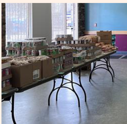
THE FOOD SHELF'S TEMPORARY HOME IN WINOOSKI.

These temporary changes allow us to continue offering essential services without interruption. Guests can still access a variety of nutritious food options including fresh produce, assorted frozen meats, and shelf-stable canned goods.